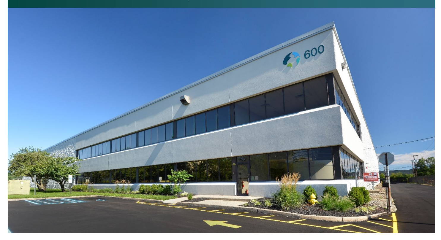
600 Federal Boulevard Carteret, NJ 07008 USA