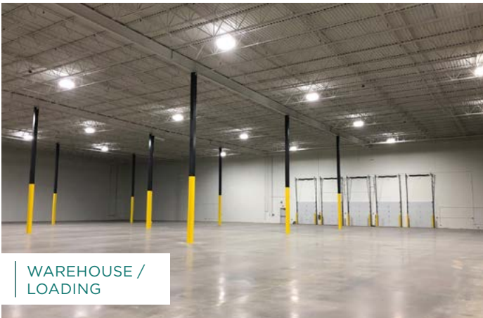
WAREHOUSE / LOADING