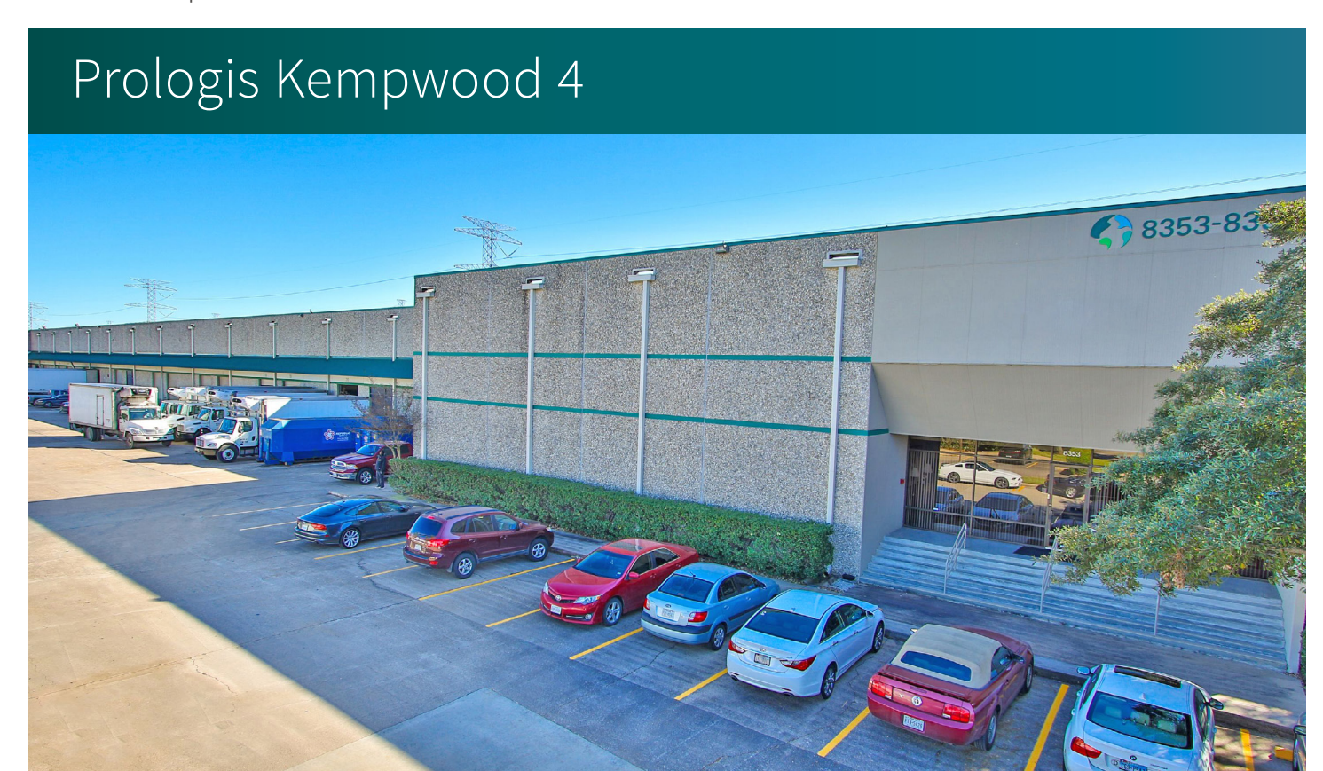
8353 Kempwood Drive Houston, TX 77055 USA