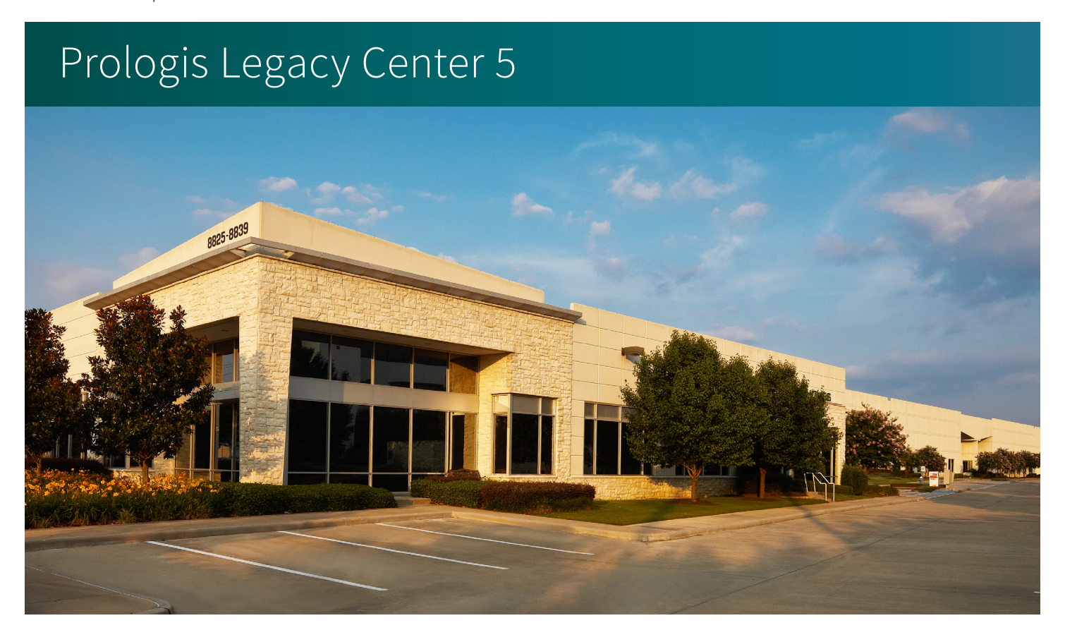
8831 N. Sam Houston Parkway W Houston, TX 77064 USA