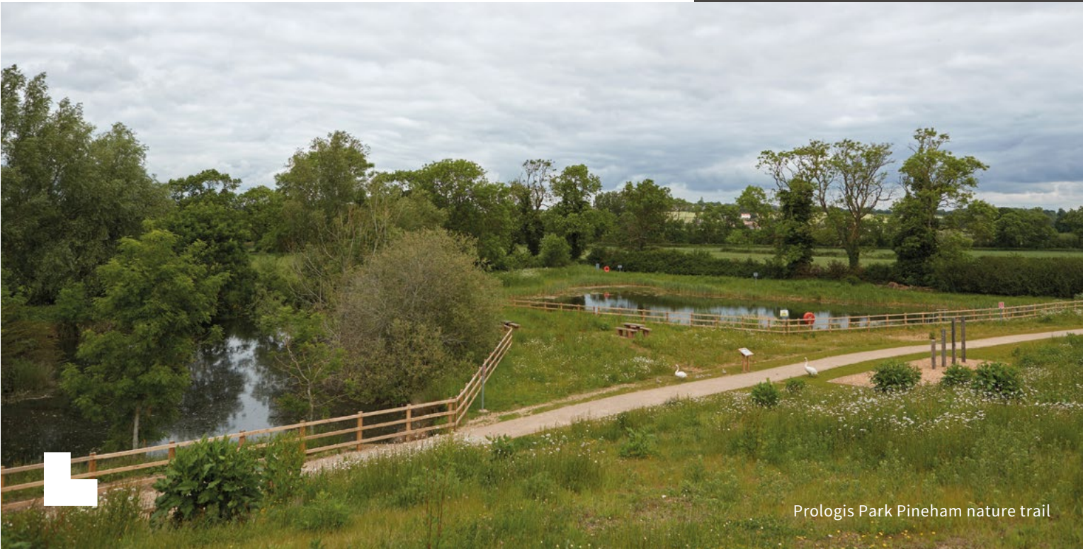
Prologis Park Pineham nature trail

I will be your main point of contact. I am passionate about the customer service we provide and derive real pleasure from watching the businesses on our parks thrive. My real focus is around understanding our customers’ needs and helping them grow within our network.