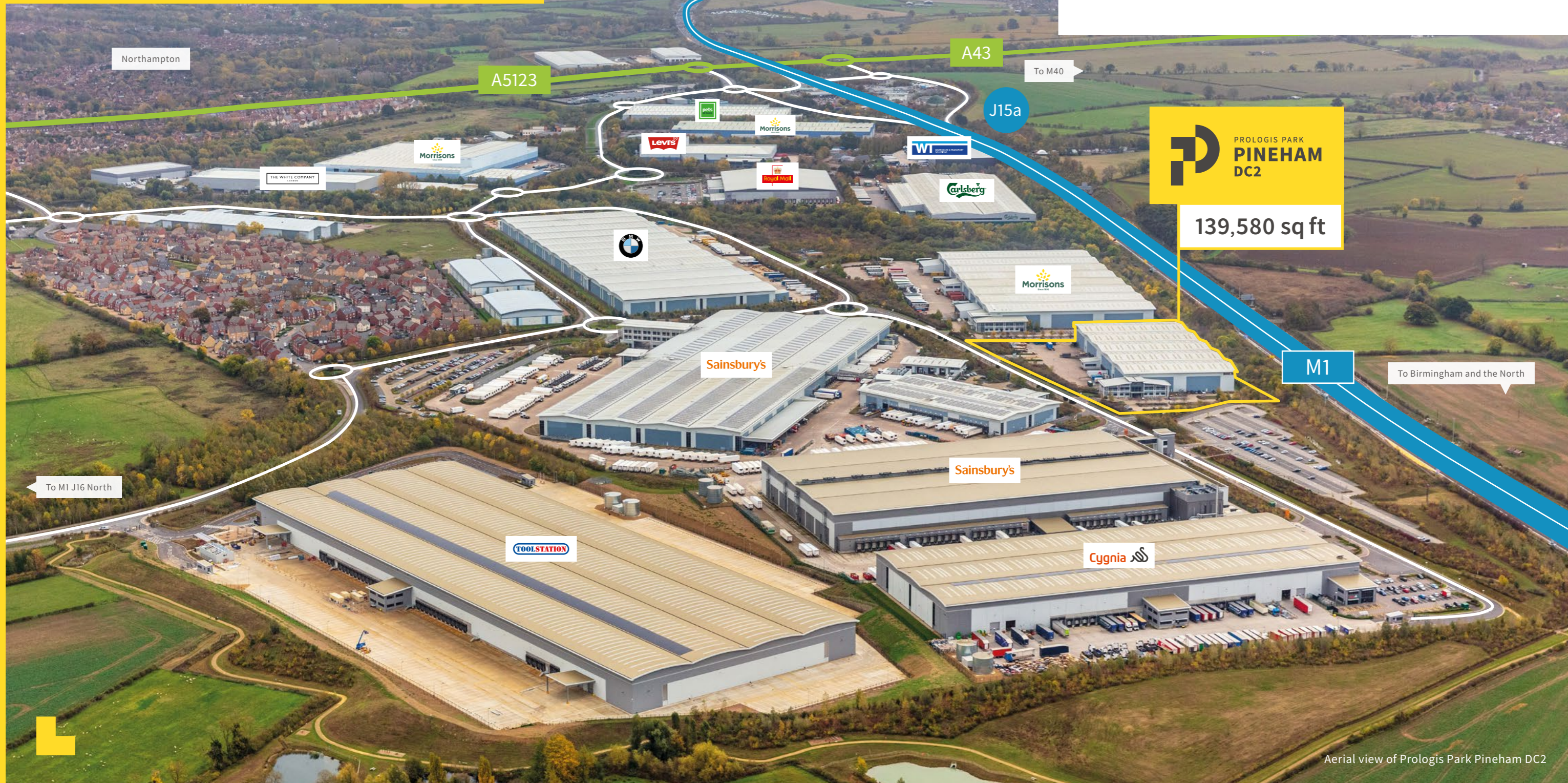
Aerial view of Prologis Park Pineham DC2

The park provides immediate access to the national motorway network via J15a and the primary consumer markets nationally, as well as offering a readily available workforce.