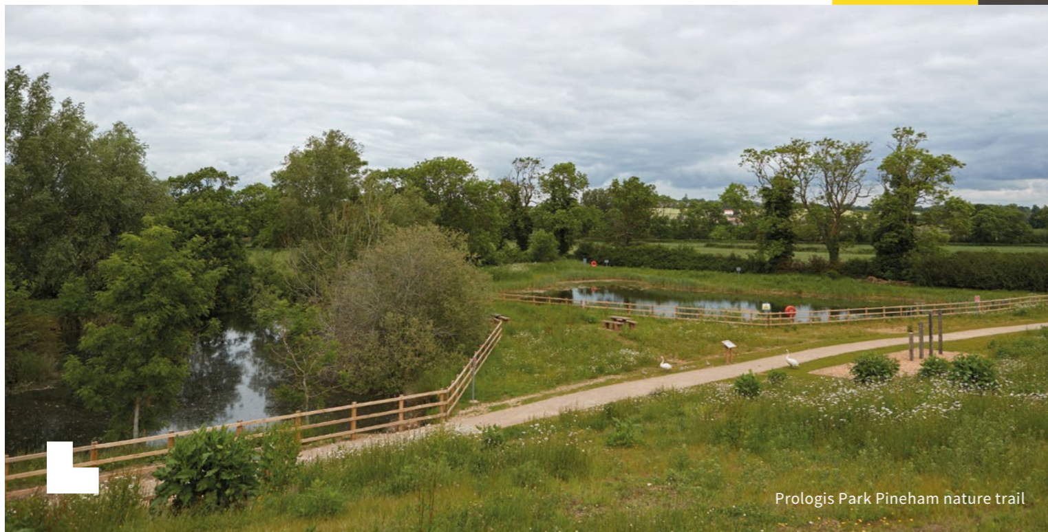
Prologis Park Pineham nature trail