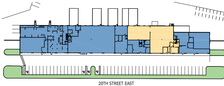
BUILDING 9, SUITE 3204 OVERALL PLAN