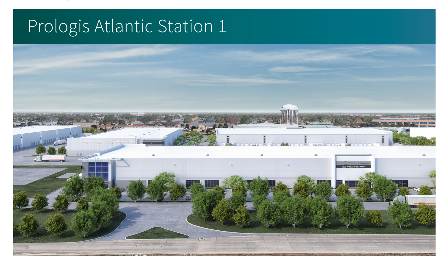
2300 W Plano Parkway Plano, TX 75075 USA