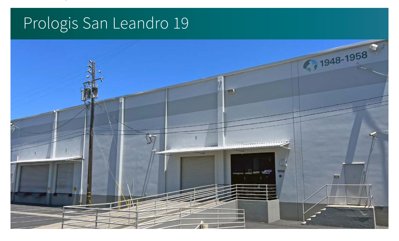
1950 Williams Street San Leandro, California 94577, USA