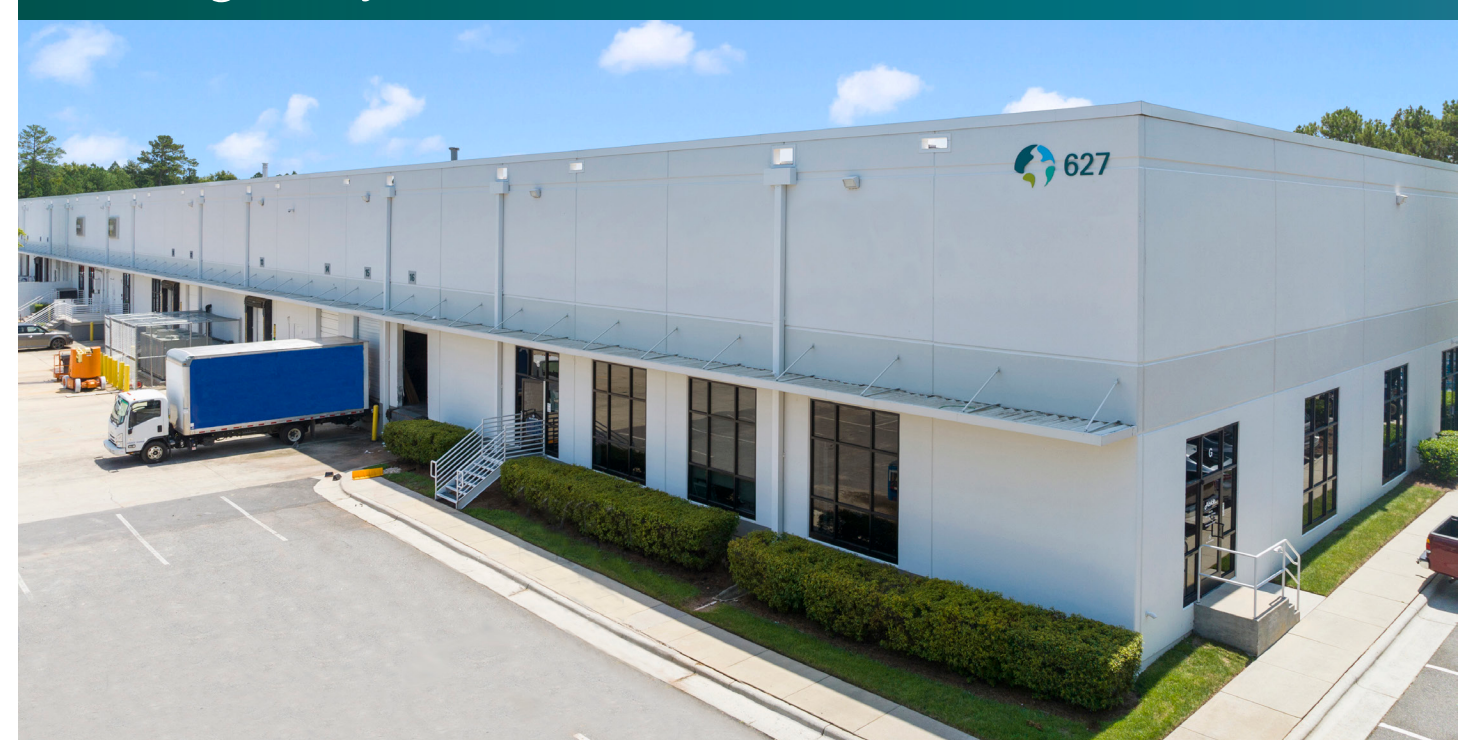
627 Distribution Drive, Suite G Morrisville, NC 27560 USA