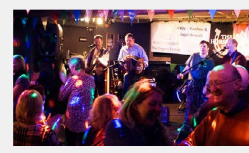
The 'Bounty Heads' at the Diggers' Festival