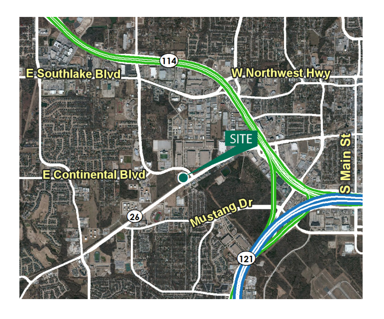
1100 S Kimball Avenue Southlake, TX 76092 USA