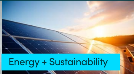
Energy + Sustainability