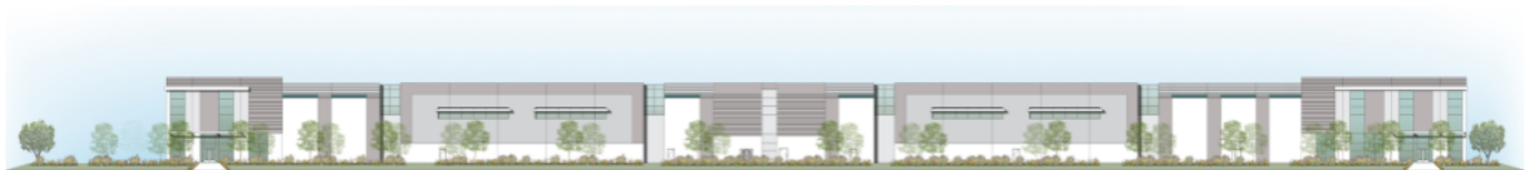
Planned East Elevation