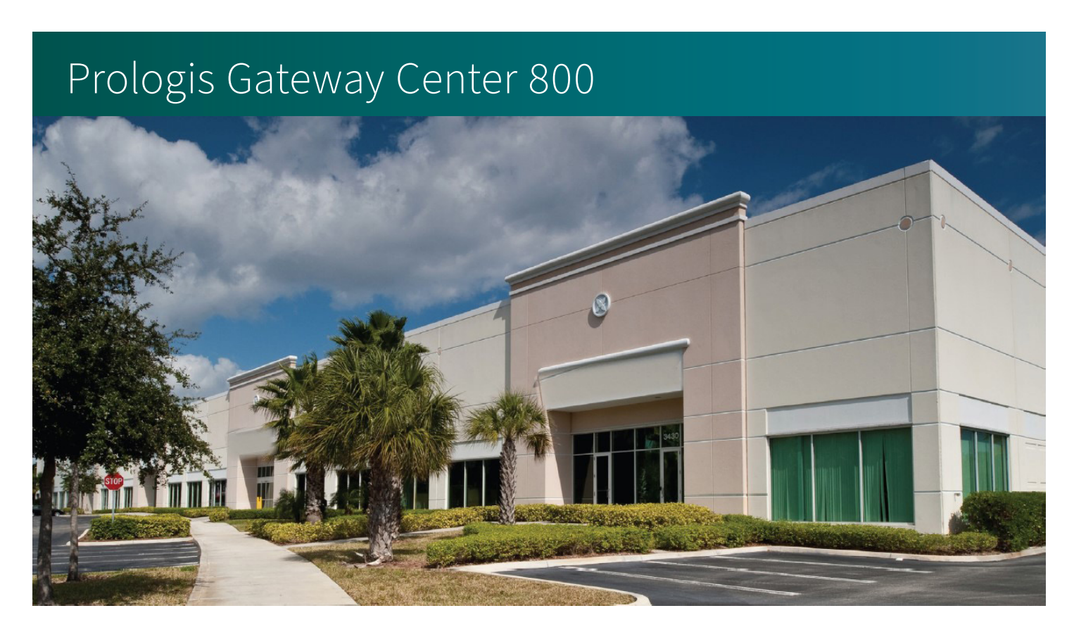
3430 Quantum Boulevard Boynton Beach, FL 33426 USA