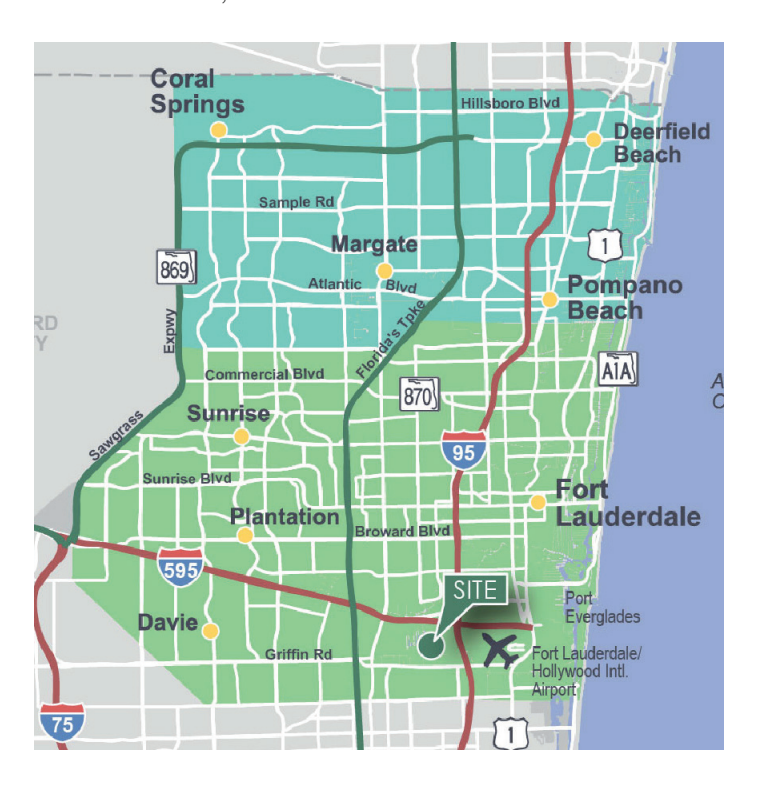
3715 SW 30th Avenue Fort Lauderdale, FL 33312 USA