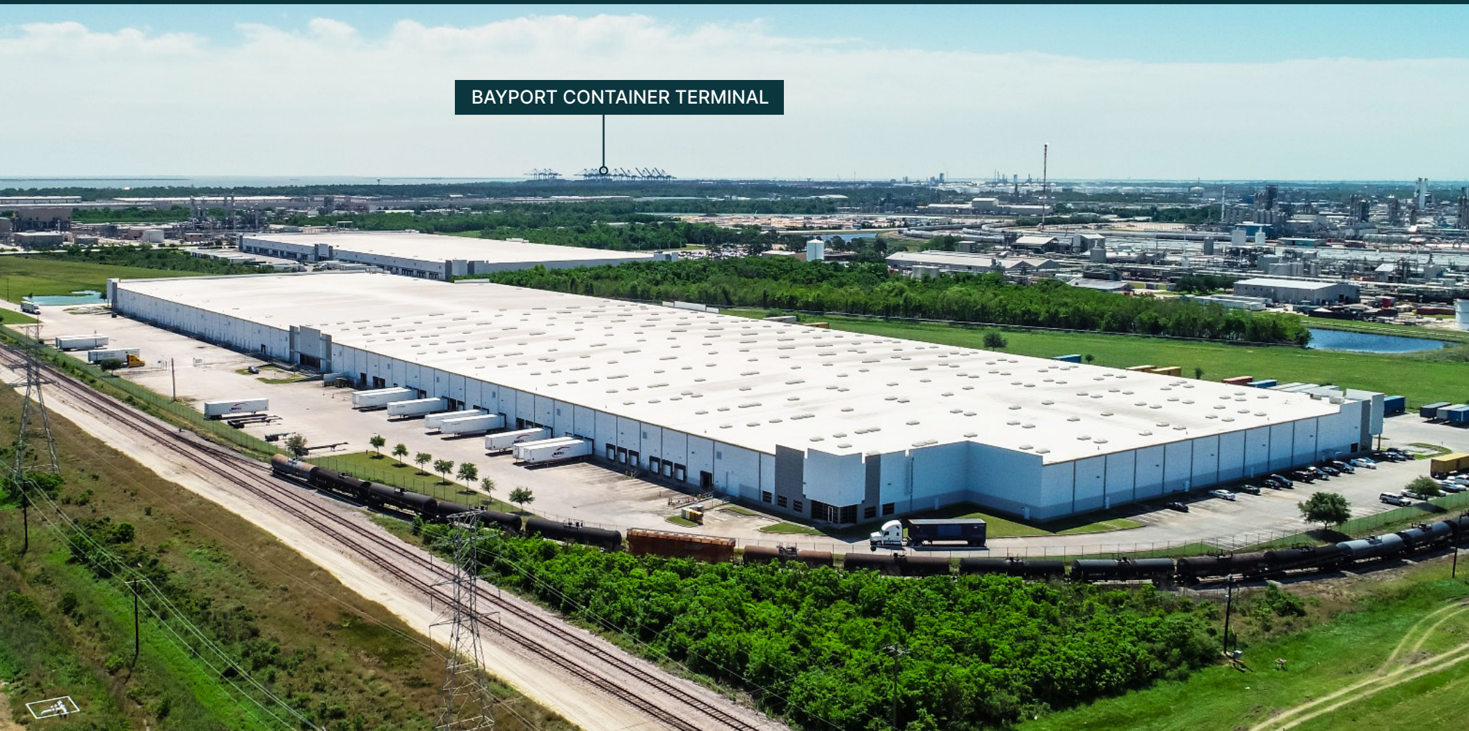
BAYPORT CONTAINER TERMINAL