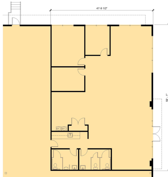
SUITE B OFFICE PLAN 1/8" = 1'-0"